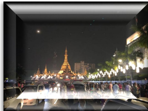
Christmas scenes in Yangon.

Traffic jams on Christmas day, and from time to time people open the window to take pictures of Christmas scenery. It is beautiful at night. People walk in the direction of and enter the churches on Christmas eve. Various songs celebrating Christmas float in the air, and walking on the street yields a strong Christmas atmosphere.