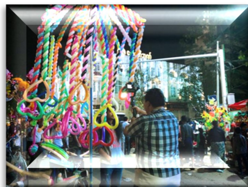
People celebrating in Yangon

In order to celebrate Christmas, various performances are performed. The stages are beautiful, and singing stars are invited to perform. It is good, and the locals regard the atmosphere for Christ-