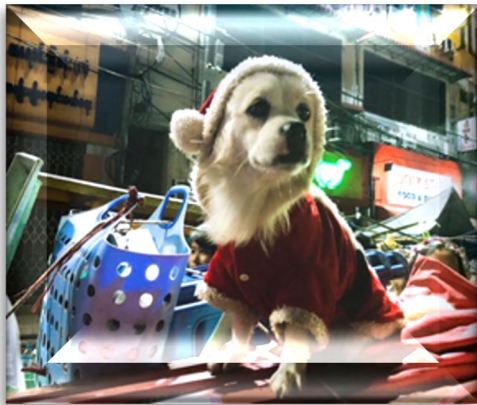
A dog in a Christmas suit

Myanmar is a country in southeast Asia. It borders the Andaman Sea to the southwest, India and Bangladesh to the northwest, China to the northeast, and Thailand and Laos to the southeast. Myanmar was once known as Burma, and Yangon (Rangoon), the former capital, is still the busiest city in Myanmar.