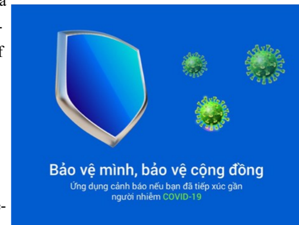
With Bluezone installed, the system has tracked 1,891 contacts

Viet Nam's Ministry of Information and Communications and