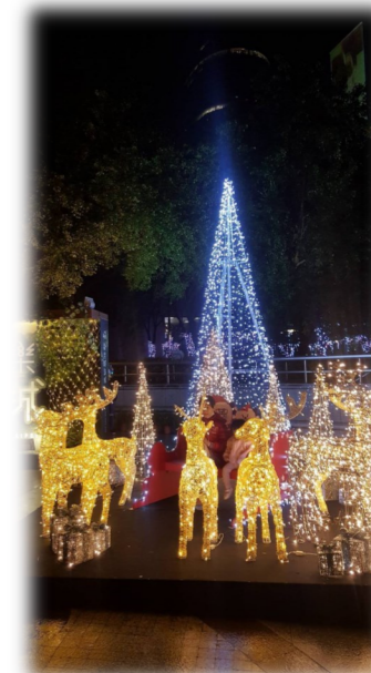
Christmasland in Taipei Christmas gifts.

In western countries, Christmas is also a time of family reunion. To welcome the arrival of relatives and friends, there are usually Christmas decorations on and in homes to increase the festive atmosphere. People sing, dance, enjoy Christmas dinner, and exchange